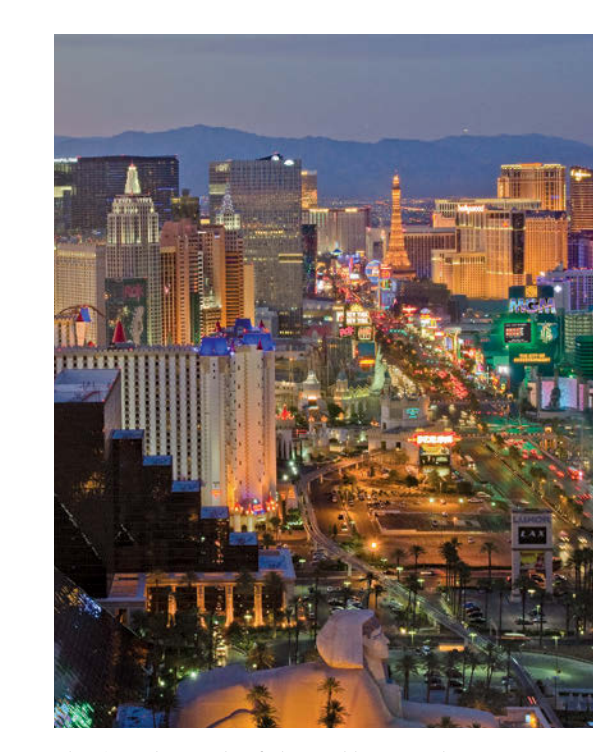
The 4.2-mile stretch of the world-renowned Las Vegas Strip attracts almost 40 million visitors from all over the world each year for entertainment and business. The dramatic architecture of recently added hotels and residential high-rises gives them high visibility in this city that is home to 19 of the world's 25 largest hotels.